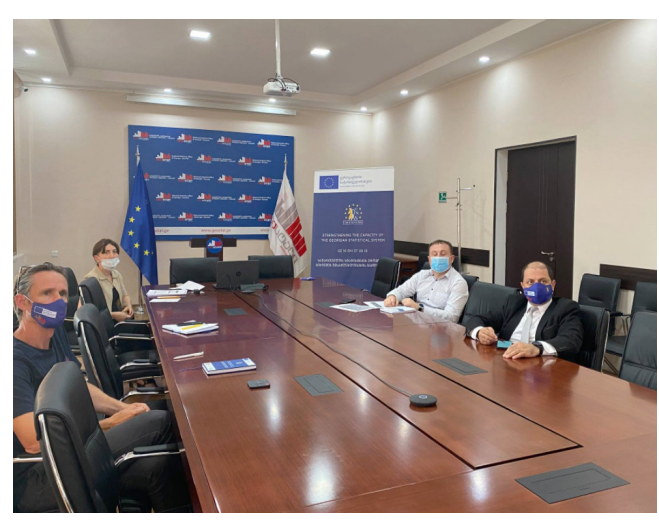
Tbilisi, Georgia. Briefing via Zoom.

As a trainer, it is extremely difficult to sense if the audience is getting the message or not. Although we may be facing a future with less travel and more online meetings, we will still need to meet face to face in order to really understand each other. For the time being, we need to learn how to small-talk and how to have breaks together on Zoom. Because COVID-19 has emphasized that questions are asked and knowledge is shared not only during presentations and technical discussions but by having coffee, biscuits and talking about life in general. Since project activities came to a halt for a couple of months, project plans have been revisited and some have been delayed. However, activities now take place online in all our projects. Even the Twinning project in Georgia, is now back on track and the activities planned many months ago now take place on Zoom. In most working groups now meets once a week instead of every second month.