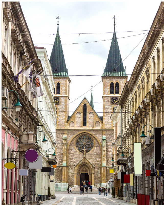
Sarajevo, Bosnia and Herzegovina

The project is the fourth Twinning project between Statistics Denmark (SD) and the partners of National Statistical System (NSS) of Bosnia and Herzegovina. The overall objective is to modernise the NSS and align its products to European standards, thereby underpinning the country's status as an EU candidate country.