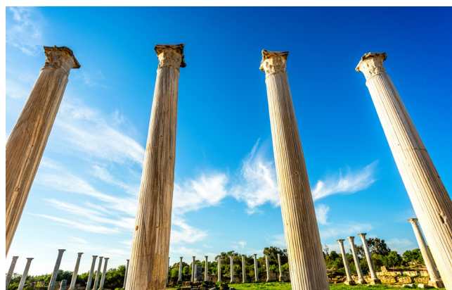
Ancient columns at Salamis, Greek and Roman archaeological site, Famagusta, North Cyprus

To improve statistical actions regarding administrative data sources management and governance, and further develop statistics in the Turkish Cypriot Community.